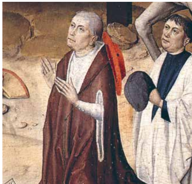
Nicholas of Cusa's idea of the Coincidence of Opposites provides a way to bring the political, economic, and social order into coherence with the laws of the physical universe, by always considering the higher power of the One over the Many.

So it's a very interesting question, and I'm looking