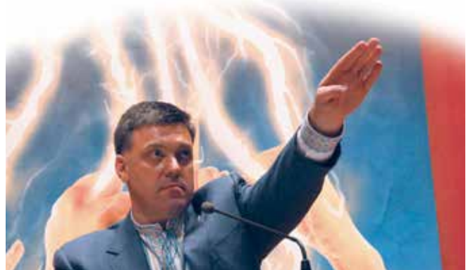
Oleh Tyahnybok, founder of Ukraine Right Sector Party.

Ukraine's embrace of the International Monetary Fund. They warned that "Ukraine is being strictly held in the status of a semi-colonial country", with a corresponding suppression of the nation's productive potential, and the imposition of the IMF's standard brutal austerity upon the nation's population. This was a recipe for disaster, and created the social conditions for the resurgence of Nazism which we are seeing today in Ukraine.