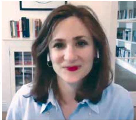
Abigail Shrier

From 2009 the service [GIDS] has been nationally commissioned by NHS England [National Health Service England] and has hence grown in size and importance within the Trust [the Tavistock and Portman NHS Foundation Trust]. It remains a unique service in the UK.... Gender has become an increasingly important part of the work of the Tavistock and Portman NHS Foundation Trust and represents a significant proportion of its clinical services. With both an adult, and the only children and young people's service being based at Tavistock and Portman, the Trust is now in a position of national, and arguably global, leadership in this area.