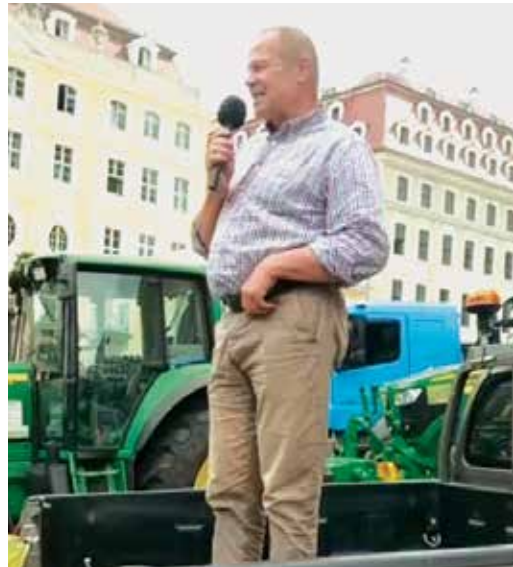
Land schafft Verbindung

On Aug. 28, The Schiller Institute released a video report on the German and Dutch farm demonstrations, and support messages to further international crossfire of action, including among scientists, and all walks of life and nations. It is titled, “Tractors Roll, Farmers Lead Fight Against Monopoly Shutdown of Food; Join Them on the Front Lines!” A crossfire email is provided: contact@schillerinstitute.org .