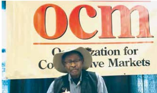
Schiller Institute Video