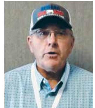
Schiller Institute Video