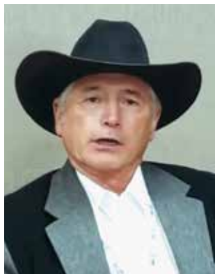
Schiller Institute Video

I am a rancher in America. I believe that all the producers in the world share some of the same problems. And we very much support producers in other countries—Germany, Australia. We understand that you have some of the same problems that we have.