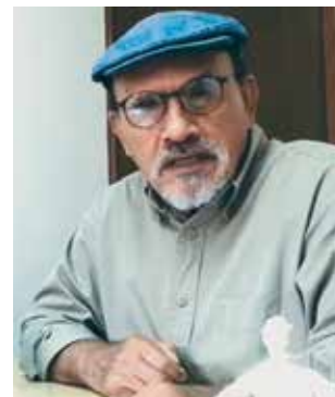
Schiller Institute Video

I live in northern Mexico, in the Yaqui Valley in the state of Sonora, one of the regions that in