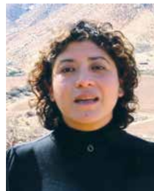
Schiller Institute Video

I taped this video from a corner of Chile, specifically from the Fourth Region. The countryside, as you can see from what's behind me, used to export table grapes, but the drought and a number of factors, including international factors of economic instability, for the first time, made it impossible to export. The situation of Chilean producers isn't separate from what's happening internationally. As we've seen in various international media, many farmers are protesting against this food crisis, and the situation is quite catastrophic. Food security is being threatened internationally by these new green policies that are being implemented and threatening producers.