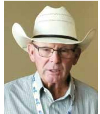
Schiller Institute Video

I'd like to welcome the farmers in Germany and also in Holland, and thank them for the courage that