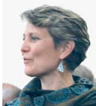
Sare for Senate

has obvious security implications for myself and each of the individuals listed, who include former U.S. Representative Tulsi Gabbard, current U.S. Senator Rand Paul, and notably 30 of us who spoke at conferences sponsored by the Schiller Institute.