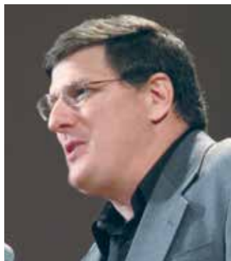
Scott Ritter

Former U.S. Marine Corps intelligence officer and UN weapons inspector Scott Ritter , who is on the Ukraine hit list, issued an Open Letter to his Congressional representatives in the State of New York, U.S. Senators Chuck Schumer and Kirsten Gillibrand , and Congressman Paul Tonko .