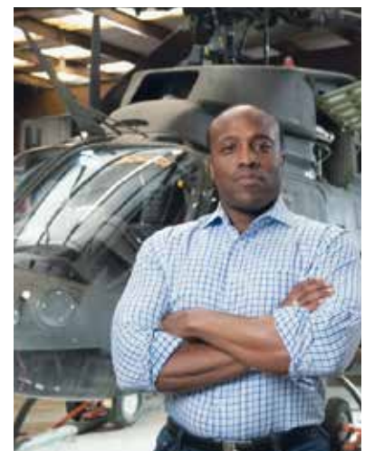
Wesley Hunt for Texas website