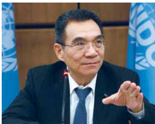
Professor Justin Yifu Lin

Prof. Justin Lin: China, a rising global power, proposed the Belt and Road Initiative (BRI) in 2013 as a development cooperation framework to fulfill its re-