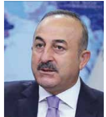
Foreign Minister M. Çavuşoğlu

Turkish Foreign Minister Mevlüt Çavuşoğlu accused certain NATO allies of wanting to prolong the Ukraine war to weaken Russia, telling broadcaster CNN Türk, April 17: