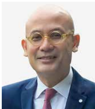
Ambassador Arrmanatha Nasir

We must allow for due diligence, and not pre-judge the work of the commission. The General Assembly must also be prudent. It is important to have received all the facts before taking action that revokes legitimate rights of its members. Moreover, the General Assembly's action must not