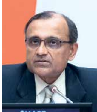
Ambassador T.S. Tirumurti