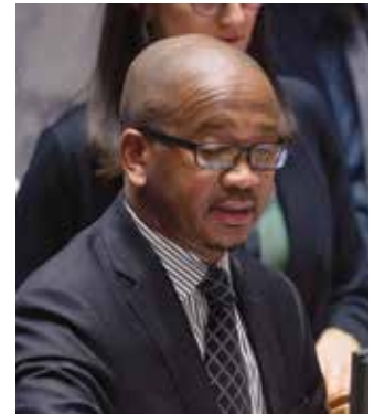
Ambassador Xolisa Mabhongo

Unfortunately, the resolution that we are considering will further divide and polarize the matter and the General Assembly, without following due process. South Africa maintains that in considering the suspension of a member of the