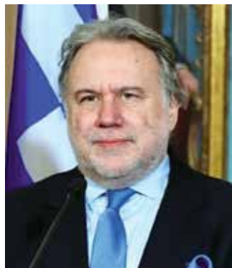
Former Foreign Minister G. Katrougalos DoS

At the April national congress of the Greek opposition party Syriza, former Greek Foreign Minister George Katrougalos spoke out against Greece being made into an outpost of the West. He said that while the