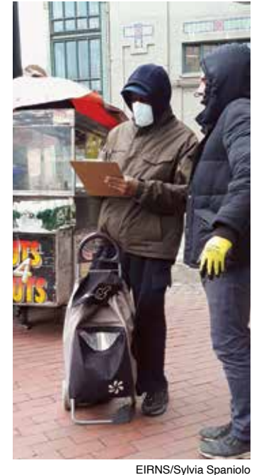
Petitioning in the Bronx, April 19, 2022.