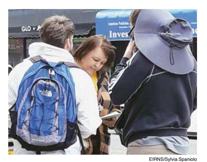
Petitioning in the Bronx, April 22, 2022.