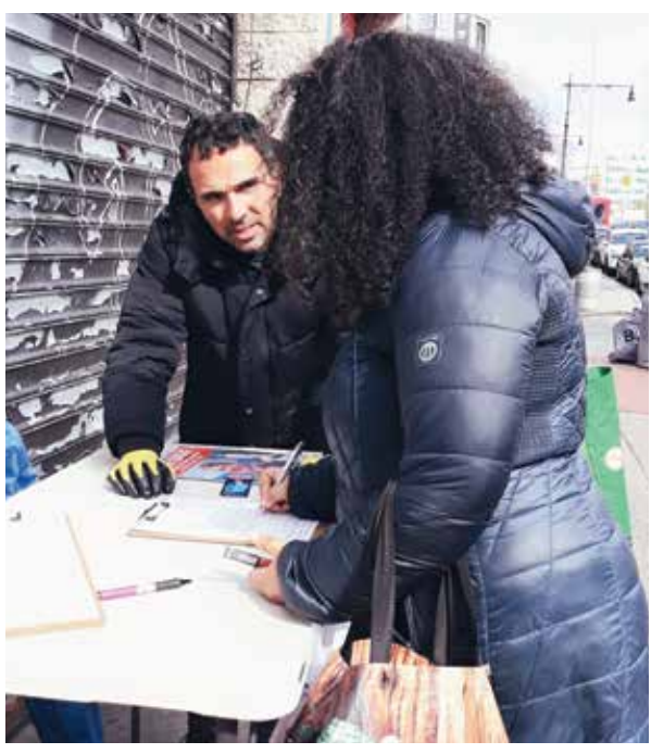
Petitioning in the Bronx, April 19, 2022.

Over the course of the next six weeks, the campaign has reported that they intend to recruit more and more petitioners to supplement the forces now mobilized, along with more workers to clerk the signatures. Along with the 45,000 valid signatures which need to be collected, the new law stipulates that at least 500 signatures must be secured from each of half of the state's 26 congressional districts.