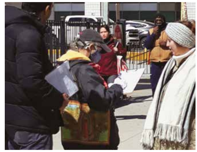
Petitioning in the Bronx, April 20, 2022.