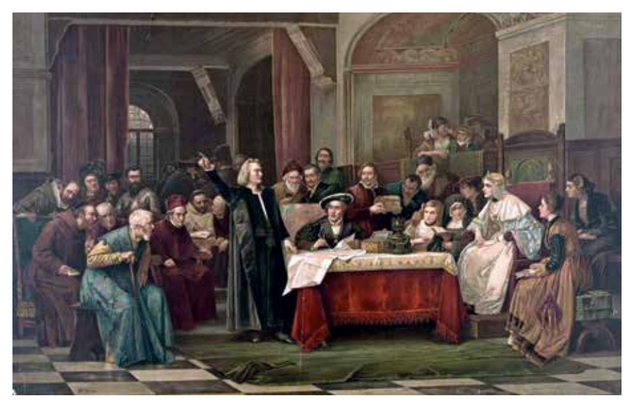
Columbus's 1492 trans-Atlantic voyage was inspired by Nicholas of Cusa's warning of the degeneration of European civilization. Here, Columbus appears before the Habsburg Queen Isabella of Spain, making his case for his voyage to the new world. Painting by Vaclav Brozik (1884).

With the close of the November 2, 2010 general elections among the states of our United States of America, the tactical political campaign of the National Caucus of Labor Committees has been shifted, by nothing more simple than the need for a qualitative shift from electoral tactics, to the urgency of redefining a national electoral strategy which expresses those new characteristics demanded by the present turn in the existential requirements of our republic's established role respecting matters of national tactical and global strategic policies—and beyond!