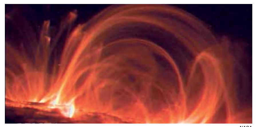
NASA ntod hv

It is typical of this situation, that of mankind's threatened vulnerability to cyclical developments in the galaxy, that our defense lies, to a large degree, in the promotion of measures of defense which depend upon the role of what will be, for us, relatively very