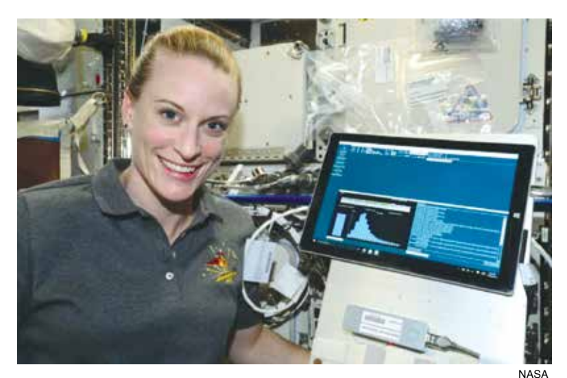
This gene-sequencing machine, used by an astronaut, reflects advances allowing smaller, lighter machines suitable for space flight. Genesequencing machines perform multiple chemical reactions that originally required significant human labor in labs and large amounts of time. The technology was first developed in 1974, became completely automated by 1986, and became very rapid and largely free of errors over the past 10 years.

A research group at Stanford University is working on a model of a possible link between HIV/AIDS, when it is not treated, and the development of the Omi-