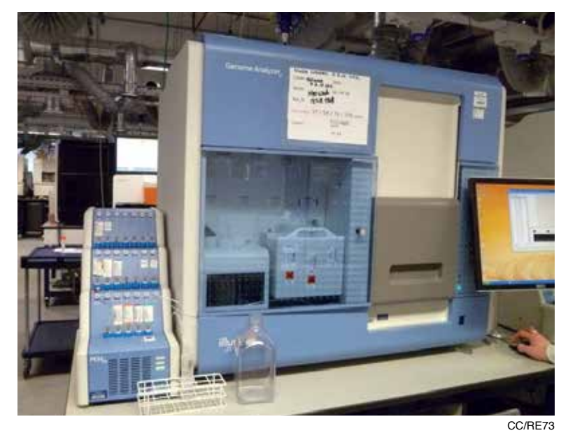
A bank of gene sequencing machines, showing how the technology can be scaled up as needed.

Having multiple infections at the same time, also can lead to immune system weakening. Tuberculosis, which is widespread in Africa, worsens the course of COVID-19. Since much of the disease transmission in Africa is water-borne, clean water is required. Refrigerators are required to keep food safe and edible, and to preserve vaccines. Electricity is required to run refrig-