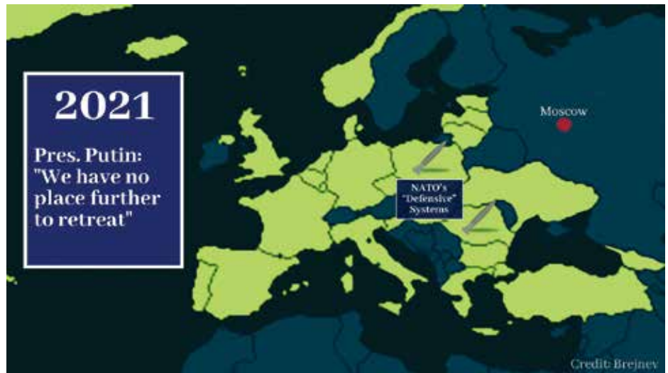
Putin: "We will take adequate retaliatory military-technical measures, and react toughly to unfriendly steps.... we have every right to take actions designed to ensure the security and sovereignty of Russia."

All of a sudden, things broke down, and Yanukovich left, because you should remember, and very often in the West, they tend to forget that the demonstrators were armed. And they killed police also. They killed