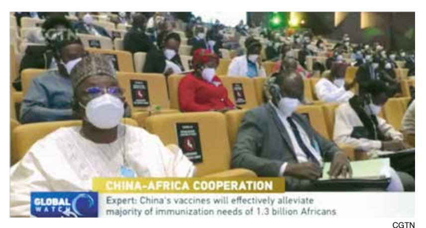
On the world stage, China sponsors the Forum on China-Africa Cooperation (FOCAC) process to deepen the partnership between China and Africa, promote African development, and build a shared future.

The discussion about moving supply chains [out of] China, decoupling, depriving them of technology—they will continue on their own, in creating their own supply chains, and their situation to do that is very good, because of their tremendous population and their focus on science and technology.