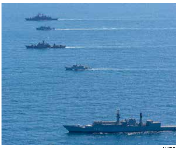
Operation Sea Breeze in the Black Sea off the coast of Bulgaria, July 14, 2020.

through confrontational concepts and strategies.