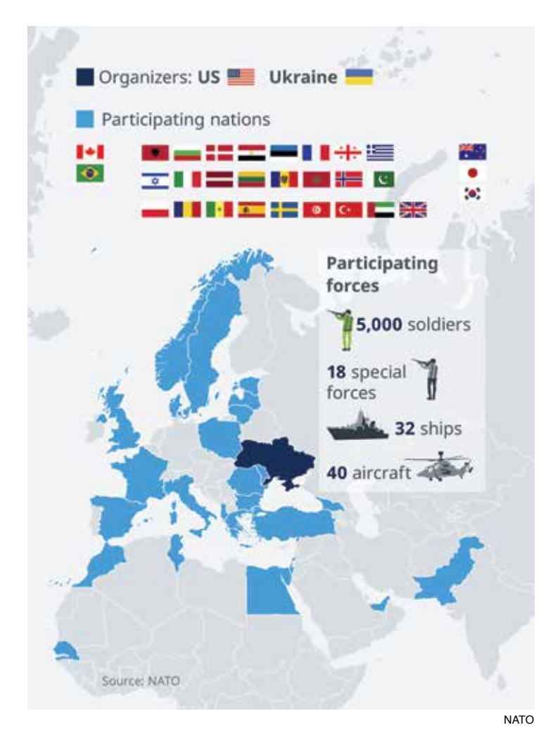
Multinational participation in Exercise Sea Breeze 2021.

as different as China and Russia, nations that seek to create a world consistent with their authoritarian models—pursuing veto authority