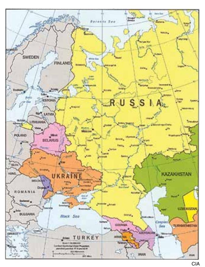
Russia and the Commonwealth of Independent States, 1995.

What we do not accept is that Gabala is a substitute for the plans that we're already pursuing with our Czech and Polish allies. We believe that those installations are necessary for the security of our interests in Europe.