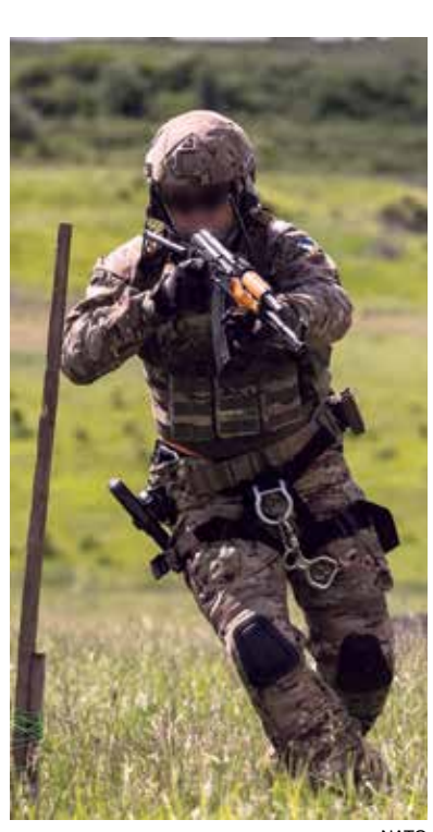
A Romanian Special Forces soldier trains during the Steadfast Defender 2021 exercise in May-June.

Atlantic to Europe. There is a movement of troops in Europe to the Russian borders. The main forces are concentrated in the Black Sea region and the Baltic region.... In total, 40,000 military personnel and 15,000 units of weapons and military equipment, including strategic aviation, will be concentrated near our territory.... In response to the Alliance's military activities threatening Russia, we have taken appropriate measures.