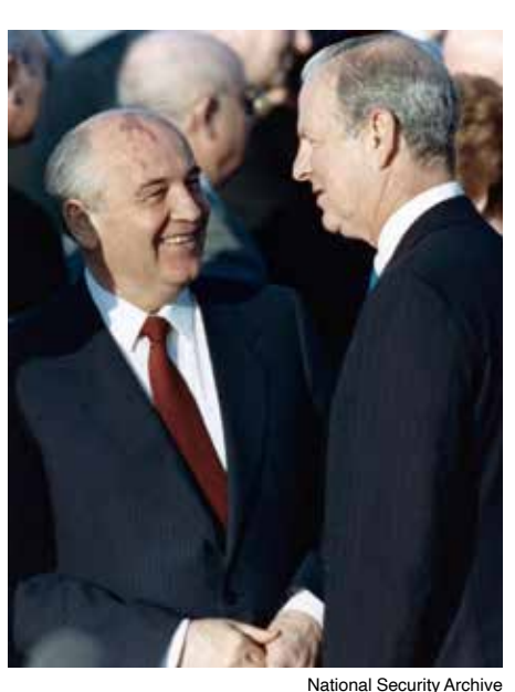
National Security Archive