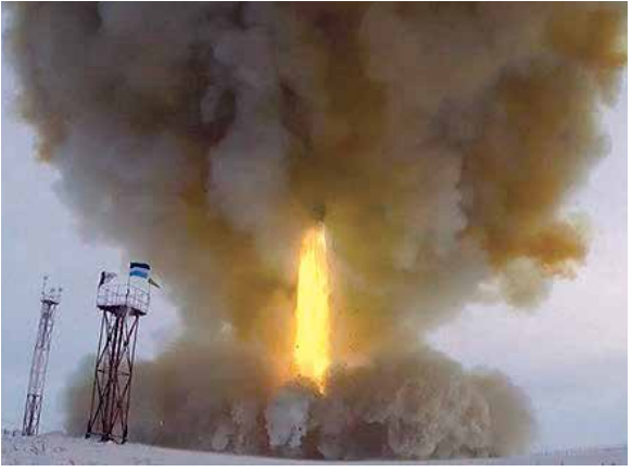
Ministry of Defense, Russian Federation

We regret that, instead of conducting a normal dialogue, instead of relying on international law, the United States seeks to prove its leadership