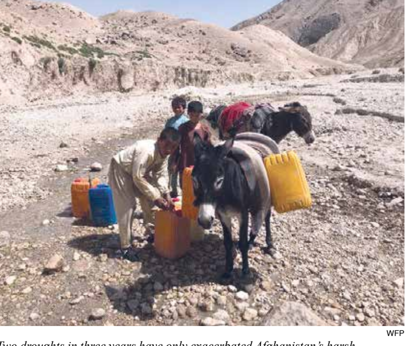
Two droughts in three years have only exacerbated Afghanistan's harsh environment. With winter closing in, human life exists on a thin margin. Here, three boys are transporting water, obtained from a wadi, on the backs of donkeys near Tangi Shadyan, September 15, 2021.

18.4 million people—were already in need of humanitarian and protection assistance in 2021.