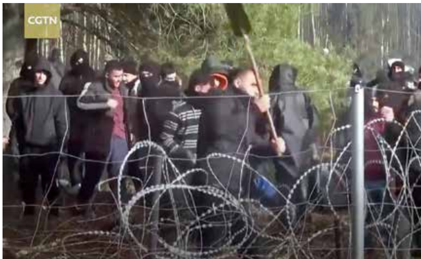
Emigrants on the border between Belarus and Poland, November 10, 2021.

In the middle of this crisis, [German] President Steinmeier has nothing better to do than to receive [Belarus] opposition leader Tikhonovskaya, who got 10%