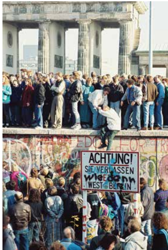
Atop the Berlin Wall near the Brandenburg Gate, November 9, 1989.

At that time, Pope John Paul II warned that one should not draw the conclusion out of the demise of the