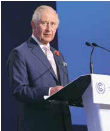
Prince Charles at COP26.