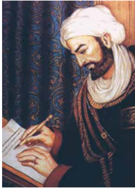
Ibn Sina (Avicenna) 980–1037.

200 books, maybe even double the amount. His Canon of Medicine was the standard work for physicians in Europe until the 17th and in some cases, even the 19th Centuries. Ibn Sina also developed the comprehensive metaphysical conception in the tradition of Plato, al-Farabi, and al-Kindi. He developed the extremely important conception of the necessary existence, the wajib al-wujud , which is Arabic for God. All the other existences only exist, according to this Necessary Existence concept, because God makes them possible. This idea of Ibn Sina's influenced many thinkers in all kinds of different religions. He was also highly regarded by, among many others, Dante, who