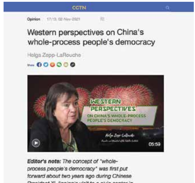
CGTN Zepp-LaRouche was interviewed by CGTN, an international English-language cable TV news service based in Beijing.

It is not because of what they say. It is because the Chinese model has upset the whole world order. For the first time, the developing countries have been offered the possibility of overcoming poverty and underdevelopment, and those now attacking China want to keep such a colonial order. I think this is really the bottom line of the accusations against China. I’ve been in China many times, and my impression was always that the spirit of the people is extremely positive [and] optimistic [about] the future. Therefore, the CPC must be doing