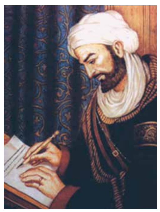
Under the name "Operation Ibn Sina," after the 11th century polymath, Ibn Sina (Avicenna), Helga Zepp-LaRouche is mobilizing the world for the building of a modern health system in Afghanistan.

We will publish that. I plan to put out a statement confronting the so-called "traffic light coalition," the parties trying to form a government in Germany right now, who all are pushing legalization, and obviously they can not even read what's been published in the