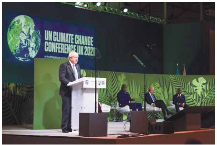
UK Government/Karwai Tang