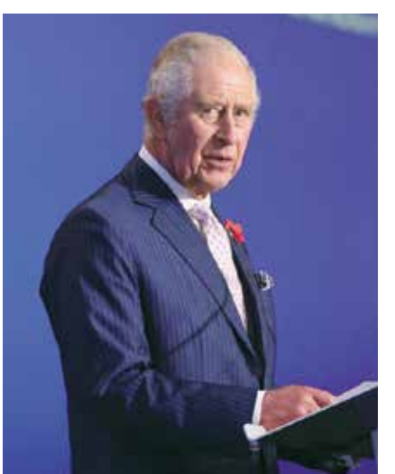
No. 10 Downing Street

But I think that has been recognized by Russia, by China, and by India. India has said many times, if there is a climate problem it was caused by the so-called advanced countries, and they should take care of it, and