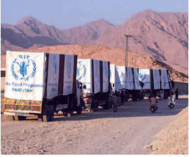
A convoy carrying nutritional foods essential for expectant mothers and children, leaves the World Food Program's warehouse in Quetta, Pakistan, heading for Kandahar, Afghanistan on September 21, 2021.

You have on top of that, the war danger. Just one