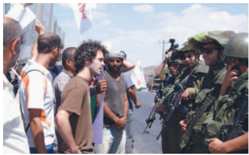
CC/Palestine Solidarity Project