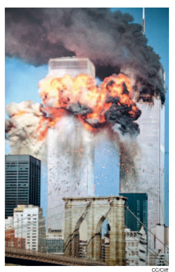
The Twin Towers of the World Trade Center in New York City, shortly after both were struck by hijacked commercial airliners, September 11, 2001.

What we're getting now, is it appears that one airplane hit each of the two towers. And I mean, that's