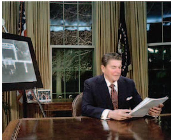
Ronald Reagan Library

China. Although Trump campaigned with a promise to resolve the huge U.S. trade deficit with China, he never blamed that deficit on China, but rather on the speculators on Wall Street and in the financial system generally, who sabotaged the industrial and scientific sectors of the U.S. economy in favor of maximizing short-term profit, “outsourcing,” “globalization,” and