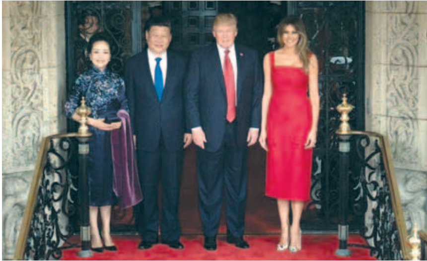
President Trump (@POTUS) on Twitter