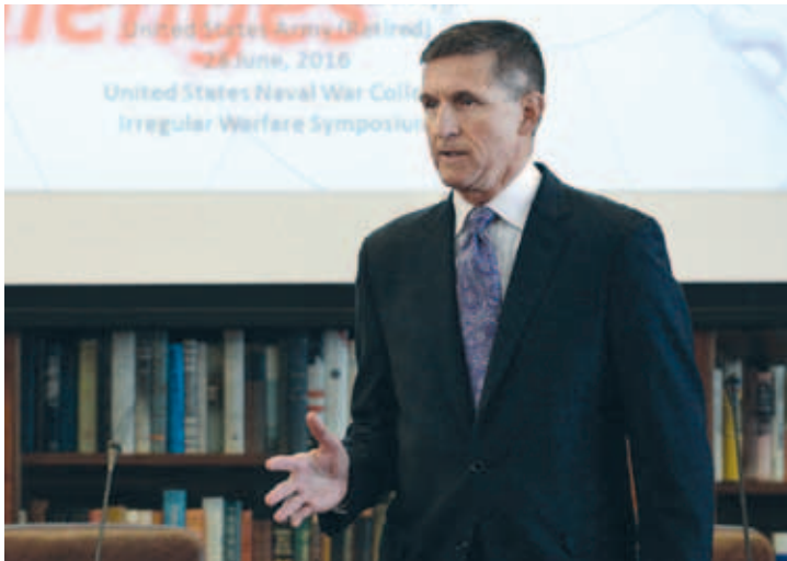
U.S. Navy/Jess Lewis

“The National Defense Strategy” (NDS) prepared under Secretary of Defense Mattis, and released in January 2018, turned Trump’s policy of building friendly relations with Russia and China totally on its head. Before that time, terrorism was defined as the primary military threat to the U.S. and the world, and Trump was essentially cooperating with Russia in defeating the terrorists in Syria through a “deconfliction” agreement for U.S. and Russian forces in Syria. But the NDS dropped terrorism in favor of defining a supposed threat from Russia and China as the primary danger to the U.S.