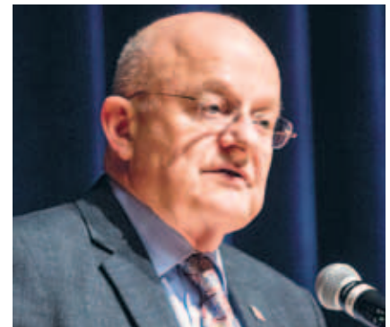
U.S. Coast Guard Academy