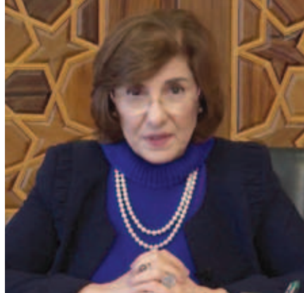
Dr. Bouthaina Shaaban

Dr. Bouthaina Shaaban is a Political and Media Advisor to the Syrian Presidency. She delivered these remarks to the first panel, "The March of Folly: Can Mankind Still Extinguish the Now-Lit Fuse of Thernuclear War?" of the May 8, 2021 Schiller Institute conference, "The Moral Collapse of the Trans-Atlantic World Cries Out for a New Paradigm."