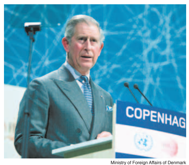
Ministry of Foreign Allairs of Denmar

The dead weight of genetic stupidity, mental instability, and disease-proneness, which already exist in the human species, will prove too great a burden for real progress to be achieved. Thus even though it is quite true that any radical eugenic policy will be for many years politically and psychologically impossible, it will be important for UNESCO to see that the eugenic problem is examined with the greatest possible care, and that the public mind is informed of the issues at stake so that much that is now unthinkable may at least become thinkable.