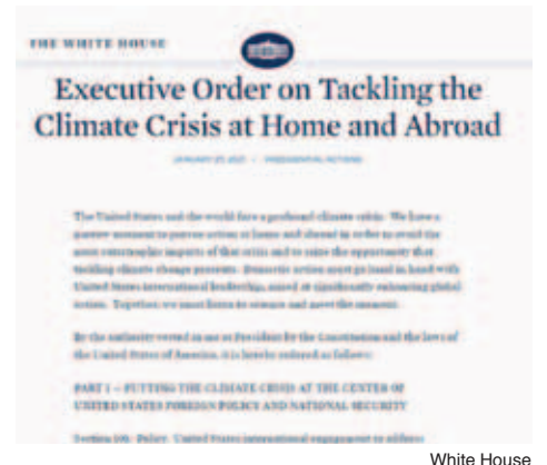
If Executive Orders 13990 and 14008, now signed by President Biden, are implemented, they will cripple America's agricultural and industrial capacity and destroy its ability to make breakthroughs to next levels of development.

ity and assets. This would threaten the nation's human existence.