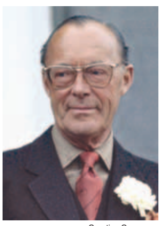
Creative Commons Prince Bernhard