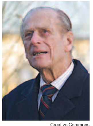
Creative Commo Prince Philip