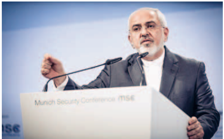
Mohamed Javad Zarif, Foreign Minister of Iran, called on the international community to condemn the assassination of Fakhrizadeh.

vehicle convoy are not clear—the latest Iranian account has it that the attack was done by remote control—it is clear that the attack was the result of a longstanding and meticulously planned operation that was expertly executed. As of this writing, no one has claimed responsibility for the attack. Iranian suspicions immediately fell on Israel with possible U.S. involvement. While Israel has made no official statements on the assassination, Israeli officials have also done little to deflect the suspicions. Fakhrizadeh did not have a high public profile but was long suspected to have headed Iran’s nuclear weapons program, known as Project Amad, from 1989 to 2003, when, according to U.S. intelligence assessments, it had been closed down.