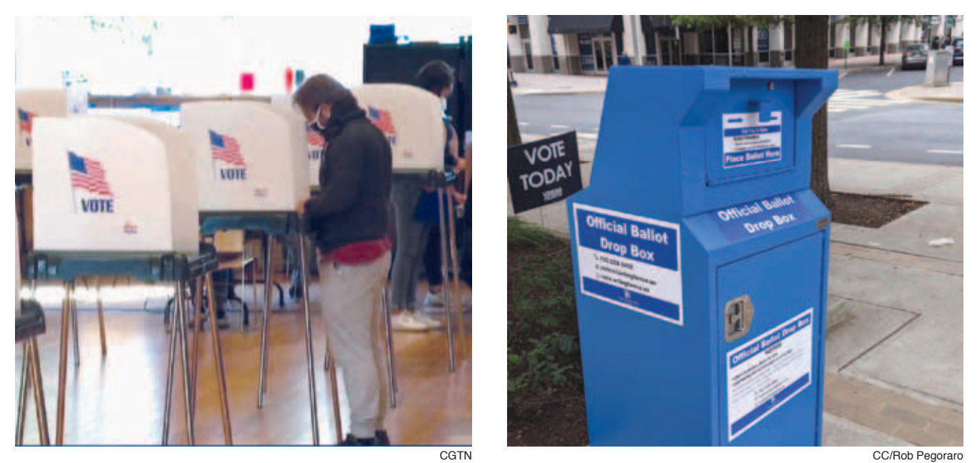
Traditional locations where vote fraud can take place: the polling place, the mail-in drop-box, and in the counting of ballots.

state; and just falsely fill them out, put them in boxes, and take them to the Post Office. We already have an example, again in Michigan, where a video camera caught a car drive up, unload three boxes of ballots, give them to somebody inside the Post Office, and drove off. So we have evidence that people in the Post Office were part of this conspiracy to throw this election.