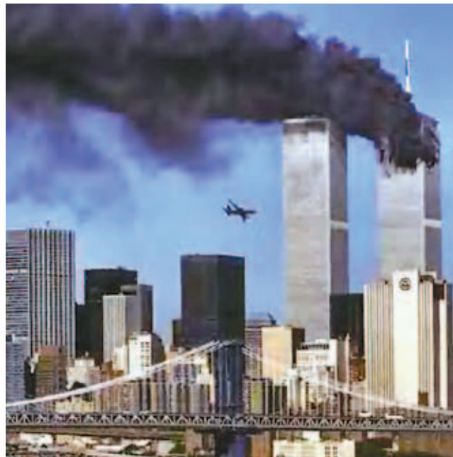
Lyndon LaRouche on January 3, 2001: “You will have small wars set off in various parts of the world, which the Bush Administration will respond to with crisis-management methods of provocation.” Shown: Eight months later, American Airlines Flight 11 about to crash into the North Tower of the World Trade Center in New York City.

When LaRouche was on Jack Stockwell’s radio show [on September 11], he made the following comments—without knowing anything, without having read a single thing, or hearing a single thing; just having seen the events of that day, because he was on the radio as the World Trade Center was coming down. And what LaRouche said is that this is not a coincidence, it’s a systemic operation.