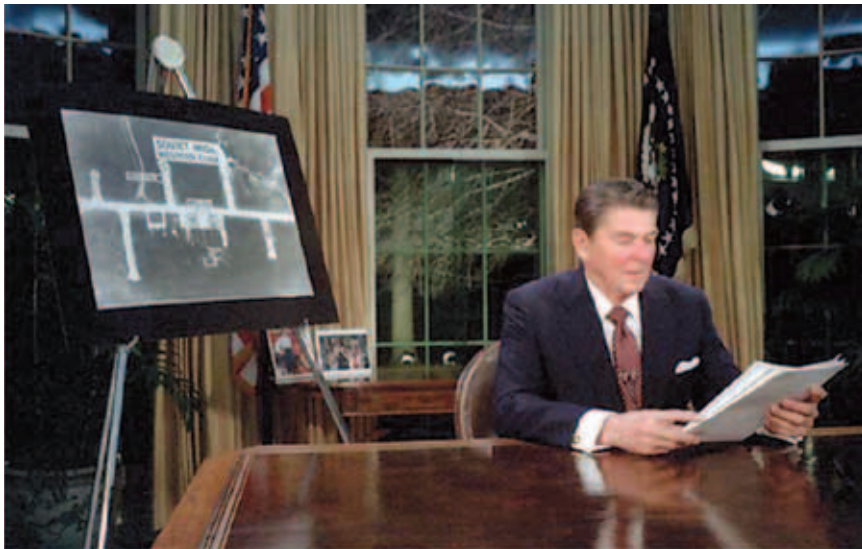
Ronald Reagan Presidential Foundation