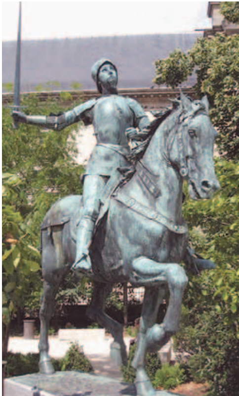
Equestrian statue by Paul Dubois, 1889