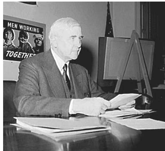
Department of Commerce