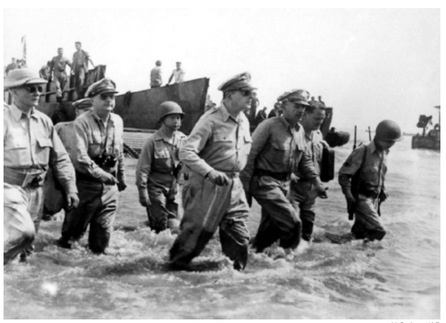
U.S. Army/AF Gen. Douglas MacArthur, in his command in the Pacific, was a master of the military flank. Here, he is shown returning to the Philippines, October 20, 1944.

temic collapse, to orchestrate a series of stimulus-response behaviors, during which the adversaries maneuver themselves, by their own energy, their own perceived vulnerabilities, into the very ultimate positions they wish to avoid. The greatest single advantage of the U.S.A. in this situation, is the rapid emergence of a clear, urgent mutual interest among the U.S.A., China, and a bloc of nations intersecting coincidence with a virtual political war against London, now centered in de facto partnership on this between Iran and Egypt. Under conditions of generalized panic, the correlation of forces and field of battle can be rapidly transformed into one favorable to preemptive action by a group of nations centered around the U.S.A. and China