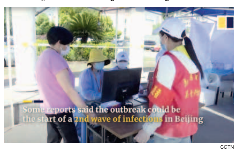
A new strain of COVID-19 may have emerged in a new wave of infections in China. Shown: testing in Beijing for that new wave, June 15, 2020.

Schlanger: One of the things that's exciting a lot of