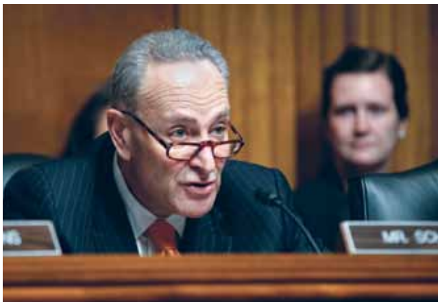
Sen. Charles Schumer

Joe plays only a minimalist ceremonial role. More likely, the continued fragmentation of the Party between the Biden establishment and the Sanders forces will result in a brokered convention in which a new can-