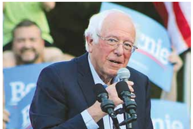
Sen. Bernie Sanders