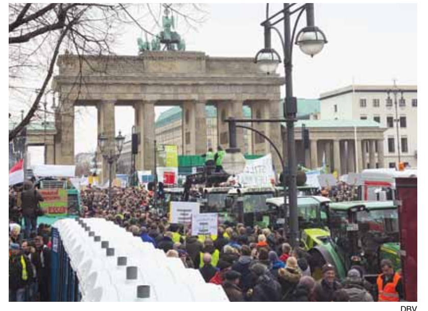
Huge German farmers' demonstration in Berlin, Germany on November 26, 2019, with tractor convoys up to 20 km long, protesting new government agricultural regulations.

In the United States, there are now hot policy discussions at meetings of cattlemen and other producers, as shown, for example, at the October 25-26 Kansas Cattlemen's Association (KCA) Convention, and in the Omaha, Nebraska rally October 2, which brought out nearly 500 ranchers, feedlot operators and others in the cattle sector, from surrounding states. The name of the event was, "Rally to Stop the Stealin'." It was hosted by the Organization for Competitive Marketing (OCM), a nonprofit group mobilizing for anti-trust relief in farm and industrial production. Daylong, non-stop presentations exposed the degree of agribusiness consolidation in the U.S. and worldwide. There were fiery demands for President Donald Trump to intervene. "All he has to do is sign an order!"