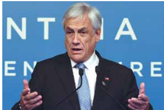
Sebastián Piñera, President of Chile.

Another symptom is the vote in Thuringia. The Linkspartei (Left Party) won 3%; the AfD (Alternative for Germany) doubled its vote, while the parties of the grand coalition all collapsed. The SPD is down to 8%; that's almost a free-fall. The attempt by the CDU to block a CDU-Left combination, which is the only one that would work. No one wants to make a coalition with the AfD. We are very close to un-governability in Thuringia. That is probably just a fore-