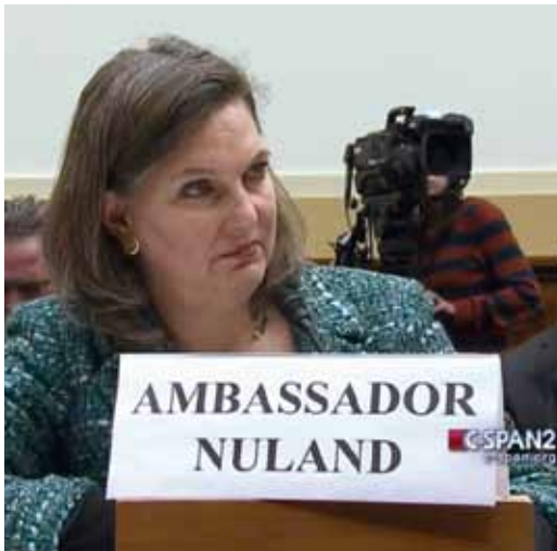
Former U.S. Career Ambassador, Victoria Nuland.