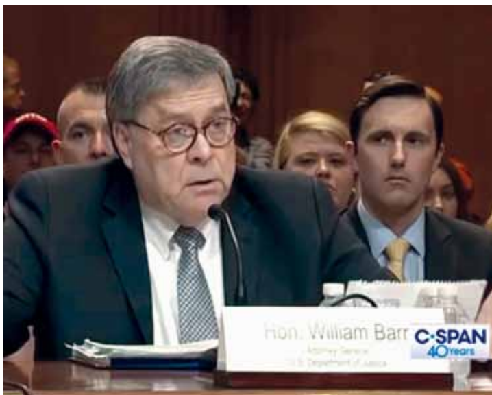
U.S. Attorney General William Barr.

Helga Zepp-LaRouche: The British Empire allied forces are making a very high-risk game right now, because what they are doing can backfire bigtime. Look at this speech Trump gave in Tupelo, Mississippi. He was very feisty, very much in direct connection with the people. He blasted the whole conspiracy against him. He said the first phase was the so-called Russia-gate; out of that came absolutely nothing. Then came the Mueller investigation, which produced zero evidence of him having colluded with Russia. Now we are in the third phase, he said, the evidence-less effort to go for impeachment. This is a big scandal, and as my late husband Lyndon LaRouche had said when Trump had won the election in 2016,— he had correctly said at that time, this is not an internal development to the United States, but it has global implications and is part of this global, growing rebellion against the neo-liberal policies of the British Empire.