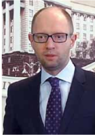
Former Prime Minister of Ukraine, Arseniy Yatsenyuk.

on the board of the Burisma oil and gas company, and he got a very high salary for having really no specific expertise. The Burisma case, which Trump asked Ukrainian President Zelensky to look into, was about why the prosecutor general who looked into corruption in Burisma was fired.