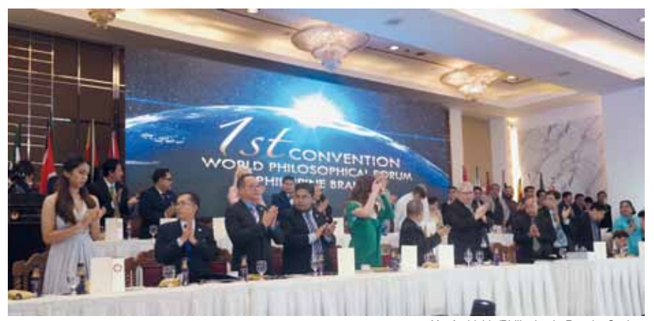
Panel of speakers at the World Philosophic Forum.