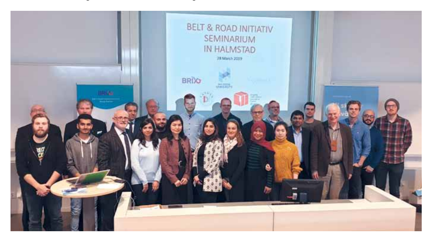
Belt and Road Seminar in Halmstad, Sweden, March 28, 2019.

Moreover, leading figures in the networks associated with the BRIX and the Schiller Institute have been active in promoting reconstruction programs for Syria, Yemen and the entire Southwest Asian region, in line with the traditional role of Sweden and Norway to actively contribute to world peace and development.