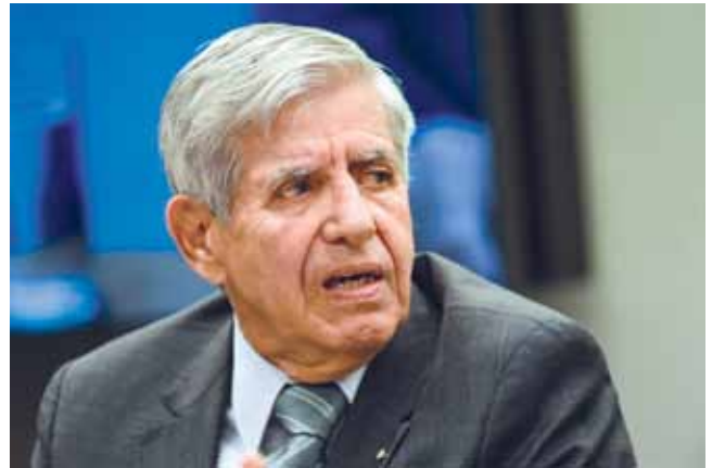
Força Aérea Brasileira