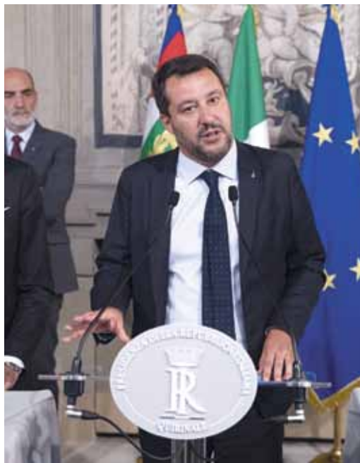
Matteo Salvini during the consultations at the Palazzo del Quirinale on August 22, 2019.

Zepp-LaRouche: Well, first of all, there have been quite a number of attacks on our international movement, which in one sense means we're succeeding at doing something good, because if we wouldn't be doing important things, they wouldn't find it necessary to attack us: The Times of London slanderous obituary of Lyndon on March 29; a one-hour slander August 18 on Swedish radio; and now, as you just mentioned, the piece in the Washington Times , com-