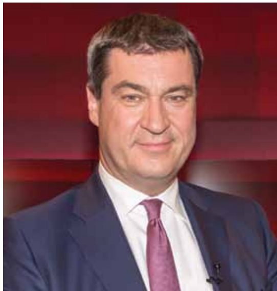
Markus Söder, Minister-President of Bavaria.

Zepp-LaRouche: Yes, at Commerzbank they are talking about closing 400 of their 1,000 branches, laying off 9,500 employees—almost 20% of their workforce—and their stock has dropped in the last several months, from EU 24 to around EU 6. So this is really another case, just like Deutsche Bank, of the absolute inability of the present liberal system to solve these problems, and Commerzbank is 15 percent owned by the German government, so this is also a sign of the times. And these are not the only banks that are in this condition: This is merely what is out in the news in Germany, but that is the condition of more or less the entire Western banking system.