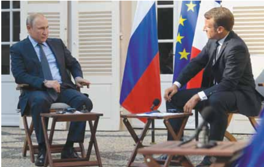
Russian President Vladimir Putin (left) and French President Emmanuel Macron meet in Bormes-les-Mimosas, France on August 19, 2019 before the G7 Summit.