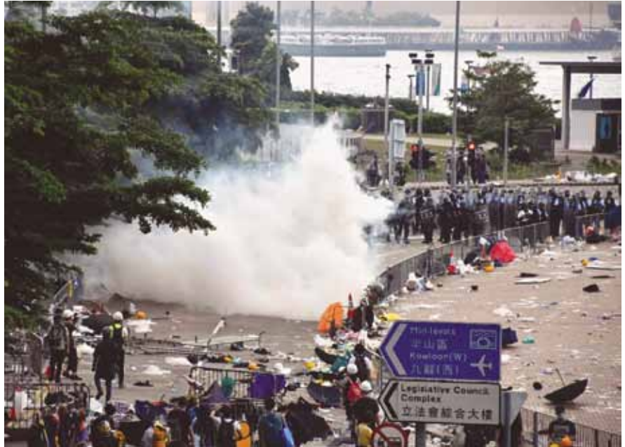
Hong Kong police disperse an anti-extradition bill demonstration on June 12, 2019.

So I think this is important, because you have otherwise an enormous effort to escalate against the rise of China with many operations, Taiwan being another, and unfortunately, Trump seems not to be in control of all of