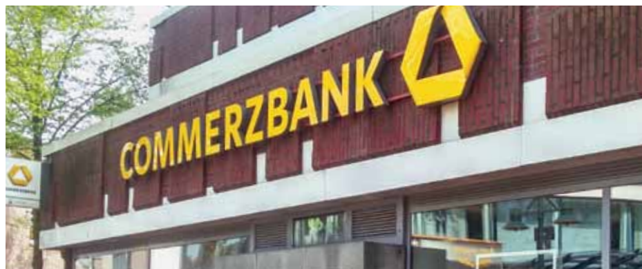
A local Commerzbank branch office in Leer, Germany.