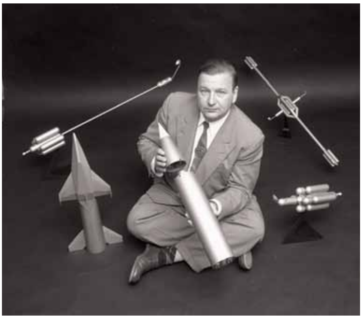
Krafft Ehricke surrounded by various satellite models, October 10, 1957.

Not only China, but all of Asia, and Russia as well, are on a very different trajectory from the neoliberal establishment in Europe or the United States. By contrast, the West is in the process of doing away with itself with the green ideology. As one can see in the condition of Europe, with its various protest movements, this policy not only destroys the foundations of the institutions underpinning the state, but it represents an existential threat. Ultimately, this self-induced decline of the West is the source of new conflicts and even the danger of a great war.