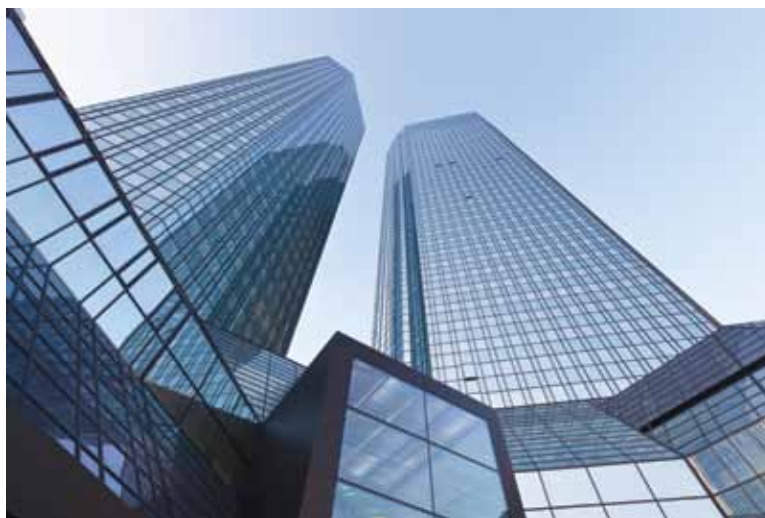
Deutsche Bank's twin towers headquarters in Frankfurt, Germany.