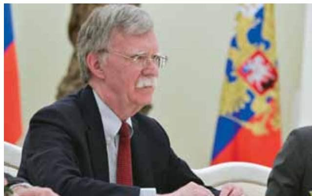
John Bolton, Assistant to the President of the United States for National Security Affairs.

I urge people to watch the video of the LaRouche case together with the three-hour video of the incredibly beautiful and moving memorial for him, because you have to see the two things together. The prosecution and vilification of my husband is in complete contrast to his real life and works which you get a glimpse of in the memorial, which combines musical tributes and other narration with key presentations by LaRouche himself. That really is the message which has to be