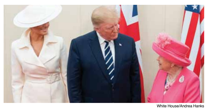
President Donald Trump and First Lady Melania Trump meet with Queen Elizabeth II in Portsmouth, England on June 5, 2019.

EIR readers know that investigators in the LaRouche movement have presented compelling evidence, from Day One, of the British origin of Russiagate, and our publications and the interventions by our activists have played a crucial role in bringing that British origin forward. A renewed focus on how the dodgy dossier of