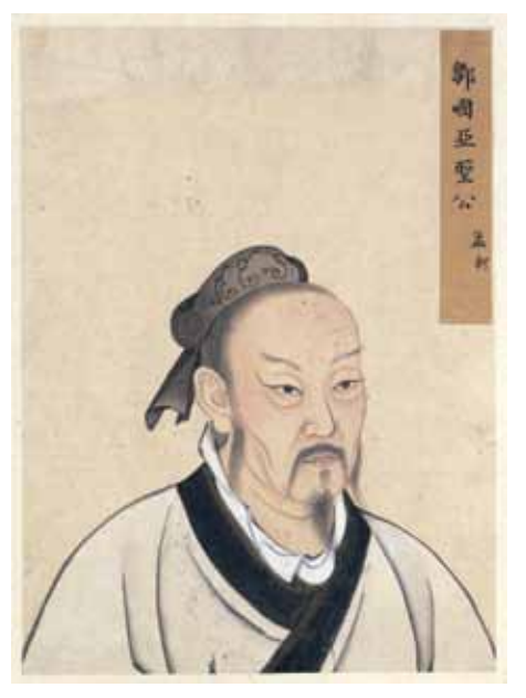
Mencius (372-289 BC) further developed the philosophy of Confucius (551-479 BC), establishing a humanist tradition in China paralleling that of Socrates and Plato in Europe.

Confucius said: The writer of this poem certainly knew the Way of Heaven. ( Mencius , Book 6, Part 1, Chapters 7-8, translation modified by the author from that of Robert Eno)