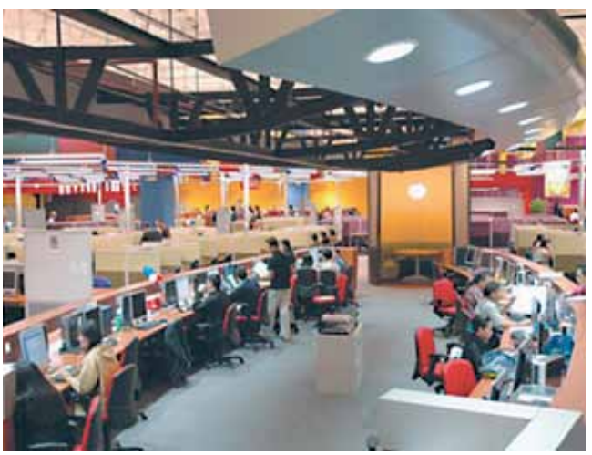
A Philippine call center.

Another problem in attracting foreign investment is the lack of skilled labor. The Philippines has a relatively well-educated population. English is taught as the primary language in the school system. But tens of thousands of bright young minds have been put to work, by primarily American multi-national companies, in deadend call centers, contributing nothing to the development of their nation. Up to this point, even graduates with engineering degrees have been forced to choose between working in these call centers, wasting their education, or going overseas among the millions of overseas contract workers so that they could at least use their skills, but often at the expense of breaking up their families. The nation has depended heavily on remittances from the millions of overseas workers to meet its debt obligations.