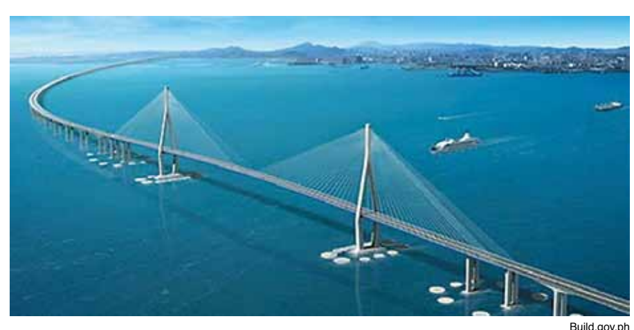
Artist's depiction of the Panguil Bay Bridge, which will be the longest in the Philippines. It is one of the "Build Build Build" projects, with funding from the South Korean ExIm Bank. Ground-breaking was in November 2018, with an estimated completion in 2021.

covered law of the universe, this knowledge becomes immediately universal, accessible to mankind as a whole, and applicable to the advancement and harmony of all people and all nations. The transformation of China in only forty years, from an impoverished nation, suffering from periodic famines, horrific political upheavals, and international isolation, to a leading industrial and scientific power, is an historic event. The BRI is actively taking this transformation process to the rest of the world, and to the so-called "developing nations" in particular.