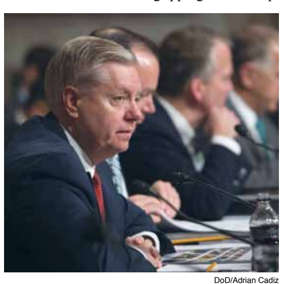
Senator Lindsey Graham

move to overturn their geopolitical design of maintaining a confrontational relationship between the United States and Russia The most recent revelations of the anti-Trump, anti-Putin campaign run by the British-Obama "spy" ring confirm that defense of this geopolitical design—which has produced endless wars, regime-change coups, huge milibudgets, tary/defense deadly austerity against the real economy of the vast majority of the people—is the actual origin of Russiagate.