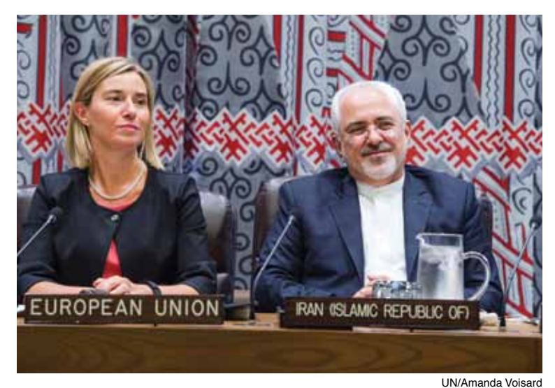
Federica Mogherini, EU High Representative for Foreign Affairs and Security Policy, and Mohammad Javad Zarif, Iranian Foreign Minister, at the EU+3 ministerial meeting, September 22, 2016.

Iran has announced countermeasures, and raised the possibly of restoring its nuclear program, which was ended under the terms of the Joint Comprehensive Plan of Action (JCPOA) in June 2015. The U.S. withdrew from the agreement in May 2018, citing Iranian violations, despite affirmation from the other five parties and international agencies that there had been no violations. Bolton and Pompeo also announced that new sanctions against Iran will be forthcoming. While Trump has maintained a hard line against Iran, Iranian Foreign Minister Javad Zarif told CBS News on May 5, "We don't believe that President Trump wants con-