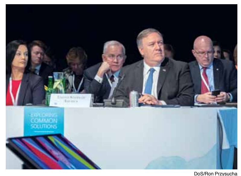
Secretary of State Mike Pompeo denounced imagined Chinese and Russian arctic "aggression," at the 11th Arctic Council Ministerial in Rovaniemi, Finland on May 6, 2019.

Pompeo next went to London, where he proclaimed that "the special relationship [between the United States and Britain] does not simply endure, it is thriving." Nevertheless, he issued pointed warnings that the U.K. must back his posturing regarding Iran, Venezuela and China. After meeting with Prime Minister Theresa May