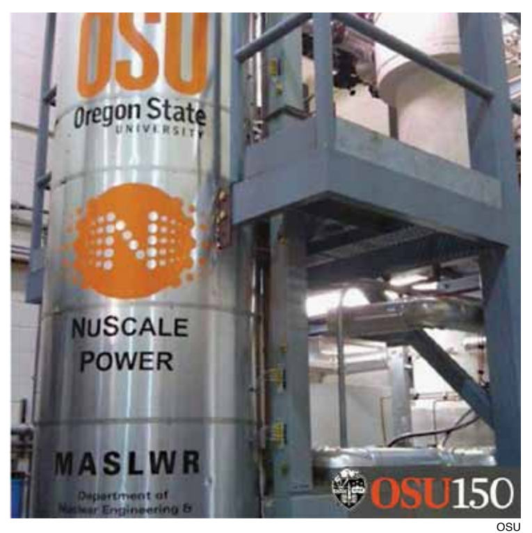
NuScale Power, a spinoff of Oregon State University, created a small modular nuclear reactor that does not need outside power to shut down during an emergency.

In other words, the success of SMRs depends entirely on their ability to be deployed in large numbers in