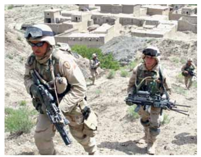
U.S. Army troops on patrol near Tora, Afghanistan, April 6, 2004.

before our eyes, is the emergence of a Peace of Westphalia approach for the Middle East. If you remember, the Peace of Westphalia was not immediately a vision for peace to end what was essentially 150 years of religious war in Europe, ending with the Thirty Years' War, but it was the result of the fact that all the parties involved recognized that the continuation of war would leave nobody alive to enjoy the victory.