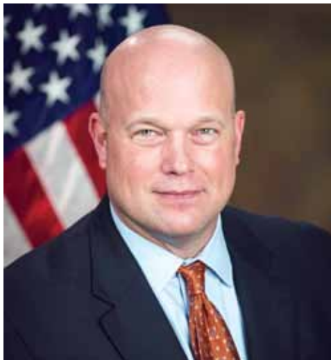
U.S. Dept. of Justice Matthew Whitaker, acting U.S. Attorney General.

In his post-election press conference on Nov. 7, Trump signalled that he is hoping for a bipartisan collaboration with Nancy Pelosi and the Democrats to work on legislation, thus putting the Democratic Party into a situation where either they start to take care of the “forgotten men and women” in the tradition of Franklin D. Roosevelt, or, if they continue with their identity politics, going for the impeachment—which as I just said, is now almost impossible—that could very well lead to a split in the Democratic Party.