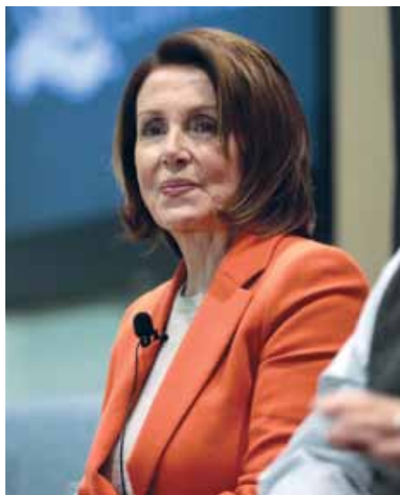
Rep. Nancy Pelosi.