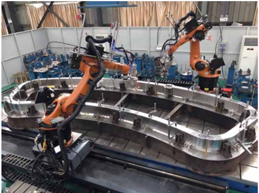
ITER Thirty-five nations are collaborating to build and operate the ITER Tokamak, the world's largest fusion experiment. Here, a high-power laser welding system developed in China is used to seal the structural case of one of many ITER correction coils.

We have said many times that you can easily retool all of these military industries to produce useful things. If the United States would move to retool its military industries to build fast train systems, new infrastructure, go into a crash program for thermonuclear fusion, and cooperate with other nations in space research and travel, we could actually use all of these things and everyone could even remain wealthy; nobody is proposing to take the profit away from people who are now stuck in military production. But we could really move all of these productive capacities into a useful situation: The United States urgently needs infrastructure. The United States urgently needs a fast train system connecting all its major cities, and naturally also the subways and the roads, electricity production and distribution, communications—there's so much to do.