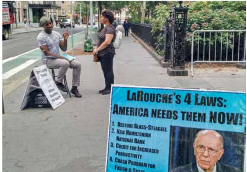
LaRouche PAC organizing in New York City, Oct. 2, 2018.

Yasuo Fukuda, the former Prime Minister of Japan, is presently in China preparing the state visit of Prime Minister Shinzo Abe. He made a very, very interesting speech, in which he said that some years ago the Japanese economy was number two [inaudible] we need in Europe. And if the United States and Russia and China can hopefully move together, then hopefully we [Japan and China] can [also] move together, then hopefully we can get the European countries to also change their views.