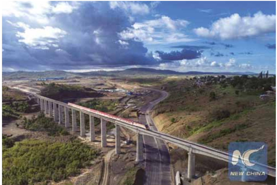
Mazaras Bridge of the Mombasa-Nairobi Standard Gauge Railway in Kenya.

As we elaborate in the Land-Bridge report, the Chinese model of economy and the American System of economy are actually much, much closer than most