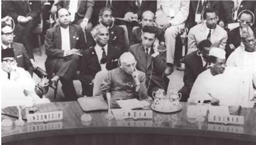
Delegates at the Asian-African Conference in Bandung, Indonesia, April 1955.

So, instead of adopting our plan, which was under consideration already then, they instead went for “shock therapy” and, from 1991-1994, dismantled the industrial capacities of Russia to only 30% of what it had been. What followed was the decade of the Yeltsin genocide, in which the Russian population was decimated by 1 million per year, due to that economic shock therapy.