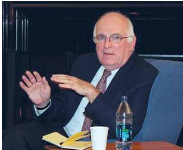
Sir Richard Dearlove, KCMG, OBE, Chief of British Secret Intelligence, SIS/MI6, 1966-2004.

According to documents finally released to Congress by the Justice Department, Ohr would meet with Steele, who would convey new “information,” and then meet with the FBI to convey Steele’s findings. This relationship lasted through May 2017, if not later. Ohr’s meetings with the FBI were meticulously recorded on FD 302 forms by the FBI agents—the Deputy Associate Attorney General of the United States having become, in effect, an FBI informant, in order to circumvent Christopher Steele’s firing as an informant for egregious violations of FBI Guidelines. Steele sought Ohr’s intervention when Senators Lindsey Graham and Chuck Grassley referred him to the Department of Justice for prosecution, because of lies he told the FBI. Steele also sought Ohr’s help in getting placed on Robert Mueller’s investigative team. These entreaties were obviously based on the calculation that Ohr and others working with him were in a position to fulfill Steele’s demands.