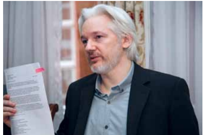
Cancillería del Ecuador