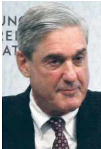
The leading British colonial administrators in the United States (left to right) John Brennan, James Comey, James Clapper; and their hitman (below) Special Counsel Robert Mueller.