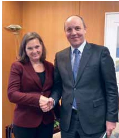
Ukrainian Embassy of Washington