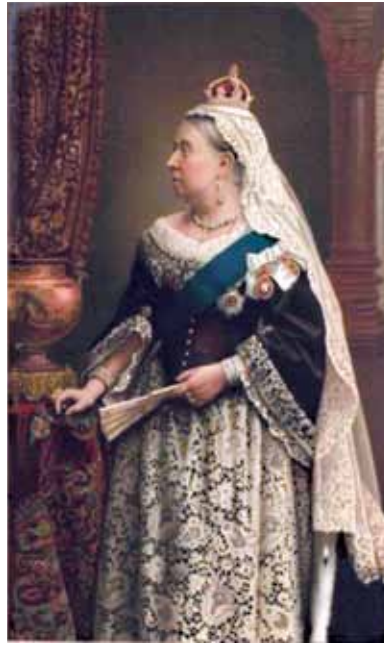
Queen Victoria (1819-1901)

The question arises: “Are the British oligarchs actually human?” In perhaps the only truthful utterance which ever passed from her lips, Queen Victoria once referred to her progeny as “frog-like,” and were it not for the recent practice by European royalty to procreate with “commoners,” it could be argued that the modern Olympian aristocracy has been self-degenerating—reverting biologically—to a lower animal species. Certainly, a history of mental afflictions, not to mention