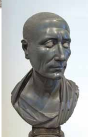
Julius Caesar (100-44 BC)

Lyndon LaRouche has defined the enemy of humanity as the “Oligarchical Principle.” It is of utmost importance that each of us thinks through the actual nature of this deadly oligarchic disease. An oligarchic system is an anti-human system. It denies human creativity. It is an entropic system—in direct opposition to the creative, self-developing nature of the universe.