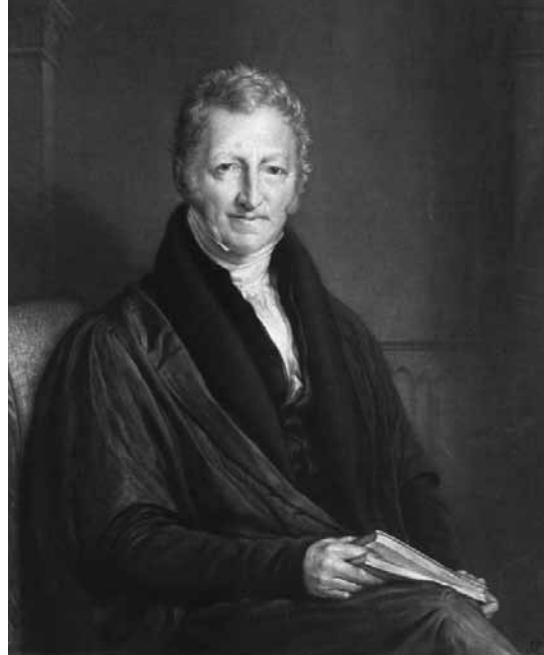
Rev. Thomas Malthus (1766-1834)