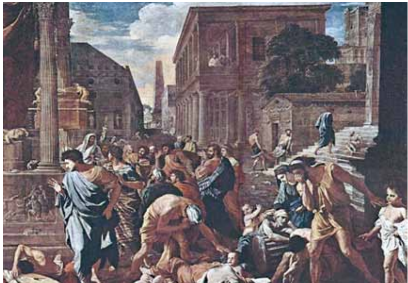
The Antonine Plague (165-180 AD) was brought home by Roman troops returning from the wars.

From no later than 165 AD, continuing for three centuries, the Roman Empire was devastated by an on-