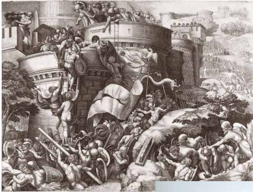
Third Punic War, 149-146 BC. Rome obliterated the city of Carthage.

comprehensive investigation is not possible within the constraints of this composition. Instead, we shall limit ourselves to certain characteristics of two case studies: the Roman and British empires.