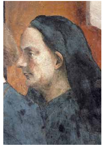
Filippo Brunelleschi's revolutionary "invention" of linear perspective, allowed the artist to overcome "sense-certainty," by portraying a three-dimensional universe on a two-dimensional surface. Shown (above left), Brunelleschi's perspective design for the interior of Santo Spirito church (Florence, 1440s), which is shown following construction, in the photo below. (Portrait of Brunelleschi (detail) by Masaccio, Brancacci Chapel, Florence, 1420s.)