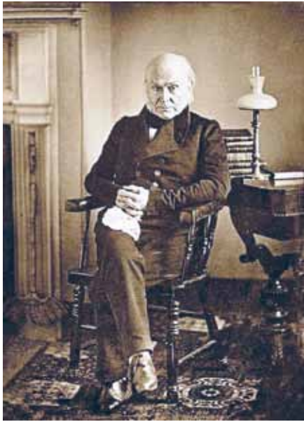
As the greatest President of that time in history, and as the “masterly patriot operating from within the House of Representatives,” John Quincy Adams paved the way for his leading successor; Abraham Lincoln.