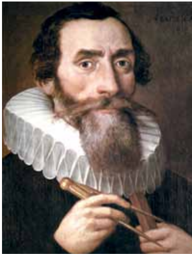
LaRouche's early discoveries in the work of Leibniz and Riemann led him to "the experience of knowing the meaning of Johannes Kepler's own discovery of the principle of universal gravitation." Shown: Kepler; the M81 Galaxy from a composite of NASA's Spitzer and Hubble Space telescopes and the Galaxy Evolution Explorer.