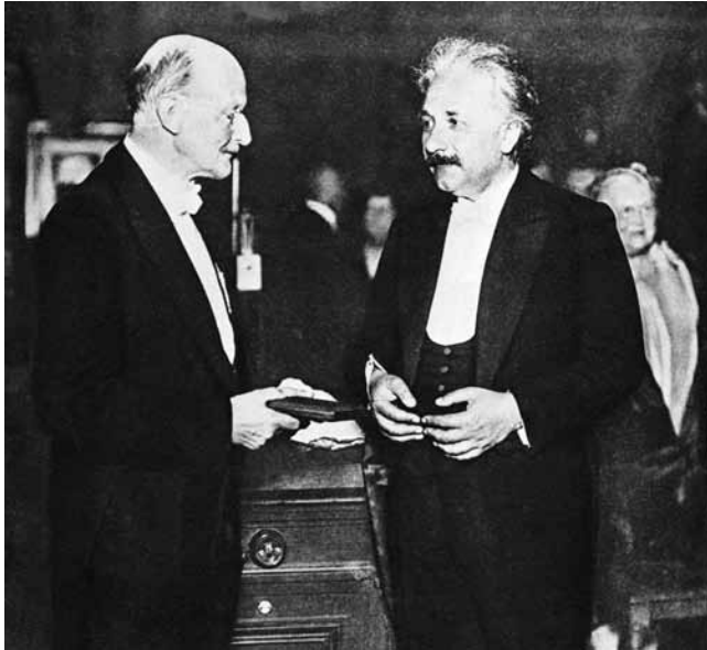
All competent approaches to matters of essential principle, made possible by the discovery by Kepler of universal gravitation, depend upon locating the principle of reason which governs the universe ontologically in the human mind. This is reflected in the genius expressed by Max Planck (left) and Albert Einstein (right).

of the human powers of sense-perception, which has come to dominate the classroom in modern secondary and university education today, British neo-Ockhamite empiricism most notably. The point is, as Albert Einstein was to emphasize later: he challenged this matter in a truly universal way.