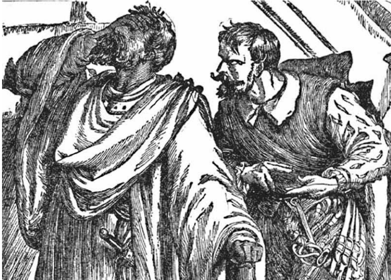
The characters in Classical tragedy are induced to cause their society to doom itself by the influence upon them of the whisperings of conspiring gods and demi-gods, like the whispering Iago of Shakespeare's Othello (shown here).

evelt, child-of-the-Ku Klux Klan Woodrow Wilson, the Calvin Coolidge who exhibited the prudence to shut up, Herbert Hoover, or the corrupt Andrew Jackson, Martin van Buren, or Polk, earlier, argues for the special virtue of a Constitution which is not a collection of do's and don't's, but a systemically thorough expression of a single, universal principle, as identified, most emphatically by the systemically anti-Locke Preamble of the Federal Constitution, a Preamble which represented a sacred devotion to defeating the great evil which dominated the world of that time, our great foe, then and now, the Paolo Sarpi heritage's "Brutish," Anglo-Dutch Liberal Empire.