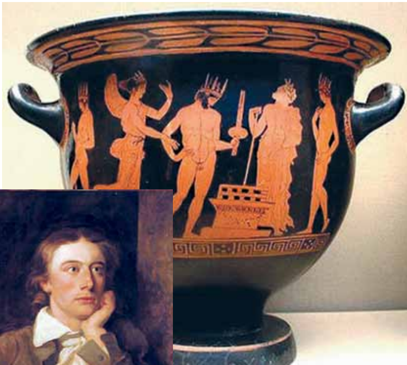
Keats' "Ode on a Grecian Urn," achieves "the quality of a perfectly ironical Classical poem."

most strongly since my adolescence. 16 The first, for its achievement of the quality of a perfectly ironical, Classical poem; the latter, especially its concluding long paragraph, peering into the mirror of my soul.