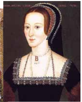
Venetian superspy Francesco Zorzi promoted the marriage (in 1533) of the seductress Anne Boleyn, to the English King Henry VIII, as part of his campaign to divide Europe between warring Catholics and Protestants. The spread of religious warfare would continue until the 1648 Treaty of Westphalia. The portrait of Henry is by Hans Holbein the Younger.

ideological oppressors in modern European society, is typified by the case of the Venetian super-spy and bitter adversary of the work of Cardinal Nicholas of Cusa’s founding of modern physical science, Francesco Zorzi (a.k.a. Giorgi). That was the Zorzi who was crucial in the work of organizing the general religious warfare among Catholics and Protestants, an effort he conducted through aid of his orchestration of the role of Venice’s agents such as Cardinal Pole and Thomas Cromwell. The effects of this included the case of Anne Boleyn, the latter she who was used as a mere sexual plaything by Zorzi, in his special role as marriage-counselor to England’s Henry VIII, in orchestrating the division of Europe between a Protestant North and a Catholic South. The turning of England in this way, was crucial in the perpetuation, and spread of the religious warfare which would not be ended until the signal intervention by Cardinal Mazarin into the process which became known as the 1648 Peace of Westphalia.